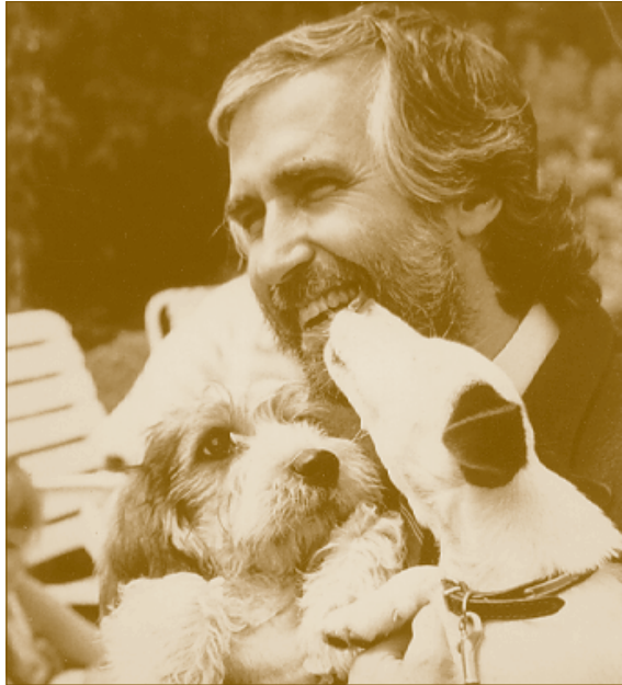
Puppy cuddle time.

Many adult dogs are more fearful of men than they are of women. So invite over as many men as possible to handle and gentle your puppy. It is especially important to invite men to socialize with your puppy if no men are living in the household. Make sure you teach all male visitors how to handfeed kibble to lure/reward your pup to come, sit, lie down, and roll over. Add a few extra tasty treats to each male visitor's bag of training kibble so that your puppy forms a fond and loving bond with men.