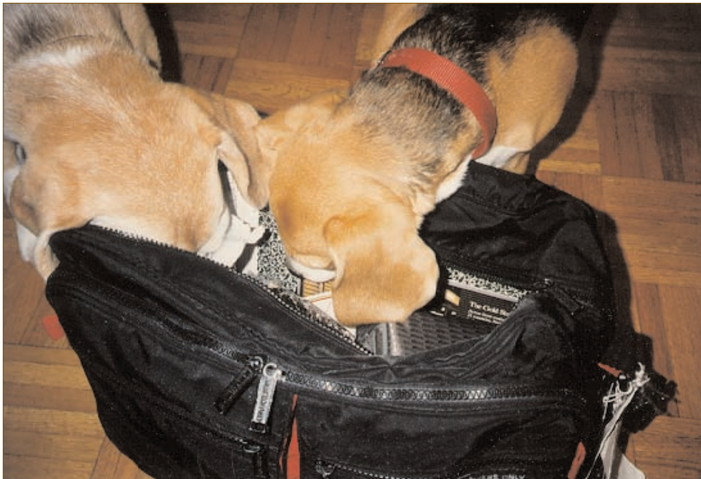
Beagles just begging to "unpack" a visitor's unattended luggage

Most doggy "disobedience" and wanton house destruction occurring in the owner's absence has nothing to do with separation anxiety. In fact, separation relief might be a more precise and descriptive term. The dog chews, digs, barks, and soils the house only when the owner is absent because he has learned it would be foolhardy to indulge in these pastimes when the owner is present. Owner-absent misbehavior is an indication that the owner has tried to suppress normal and natural dog behaviors with punishment, rather than teaching the dog how to behave—namely, how to express his basic doggy desires in an acceptable fashion. Often the term separation anxiety is an excuse for a dog who is simply not yet houstrained or chewtoy-trained.