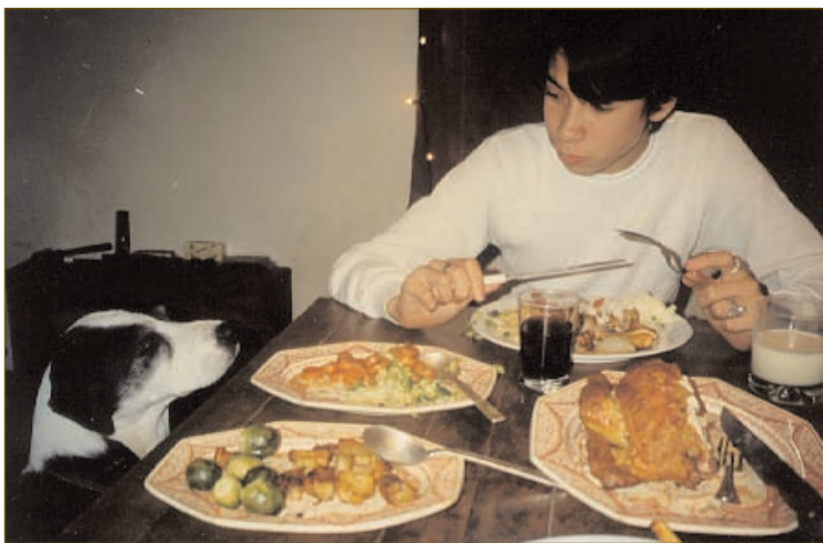
Teaching "Off" has many useful applications.

Basically, you have to teach your puppy that voluntarily relinquishing an object does not mean losing it for good. Your puppy should learn that giving up bones, toys, and tissues means receiving something better in return—praise and treats—and also later getting back the original object.