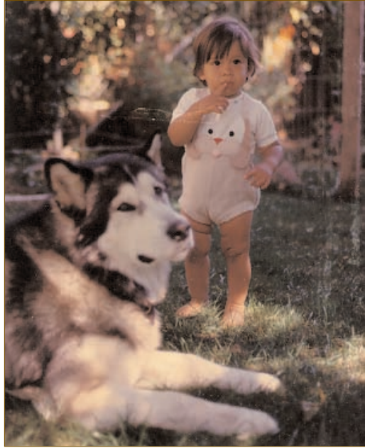
Children and puppies (or dogs) should never be left together unsupervised.

First, invite over only well-trained children. Supervise the children at all times. I repeat, supervise the children at all times. (Later on, puppy classes will offer a wonderful source of