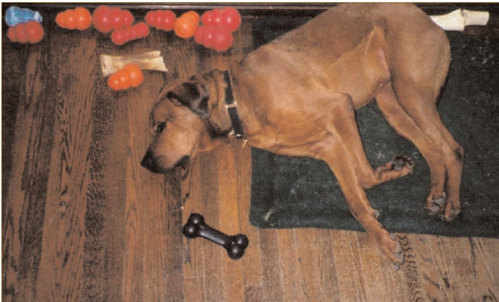
Claude Konged—peacefully passing the time when left at home alone (after chewing himself to sleep)

Give your puppy plenty of toys whenever leaving him on his own. Ideal chewtoys are indestructible and hollow (such as Kong products or sterilized longbones), as they may be