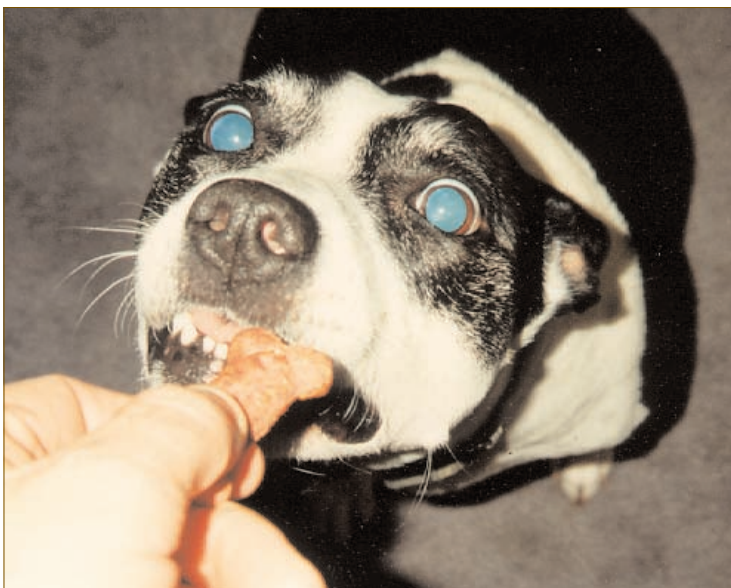
Green-eyed cookie monster

When played intelligently, physical games, such as play-fighting and tug-of-war, are effective bite inhibition and control exercises, and are wonderful for motivating adult dogs