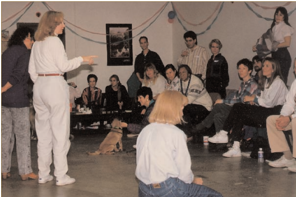
Not a bad start: eighteen people to meet one three-month-old puppy

Capitalize on the time your pup needs to be confined indoors by inviting people to your home. Your pup needs to socialize with at least a hundred different people before he is three months old. I know this may sound like a bit of an ordeal, but it is